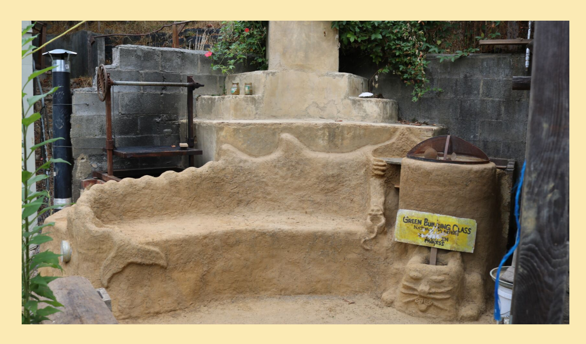
CCAT Cob Bench

The first layer of plaster is complete. A couple more coats and we will begin the paint process!